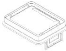
← Cover (Polycarbonate)