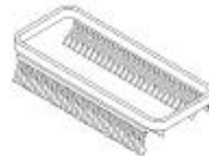
← Cushion (Polyethylene)