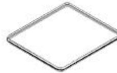
← Gasket (Elastomer)