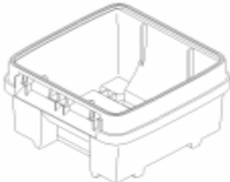
← Bottom ( Polypropylene )