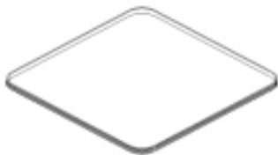
← Gasket ( Elastomer )